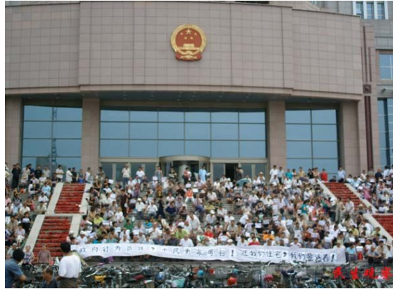
Tianjin 2007, protest against a land taking in front of a government building. 76

Petitioning in land disputes appears to be frequent, and sometimes it involves large numbers of people. Reports about such cases on overseas websites abound. Often, the number of people affected is as high as several hundred, thousand or – e.g. in large dam cases – sometimes even tens of thousands of people. 75