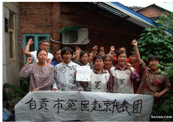
Zigong, Sichuan Province, September 2007, villagers set off to Beijing to petition against an ongoing expropriation. 72

Courts are among the authorities petitioned, too; and there are also petitions against court decisions, submitted to courts as well as other state and party authorities. This is due to the peculiar openness of the Chinese judicial process and the weakness of the judiciary. As mentioned, judges may experience pressure or interference from within their court (e.g., by the court president or the adjudication committee), from higher courts, as well as from other party and state institutions. Moreover last-instance decisions are often open to further revision in re-trial) procedures. Citizens may therefore seek to use the petitioning system to make courts file a case in which they are the complainants, for instance; or disappointed litigants may try and get an order for a re-trial of their case.