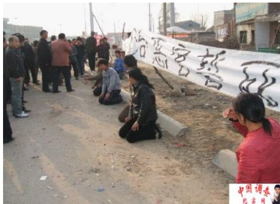
Shangqiupingtai, Henan Province, May 2008, kneeling villagers protest demolitions. 71

Article 41 of the Chinese Constitution guarantees citizens the 'right to criticise and make suggestions regarding any state organ or functionary,' and to 'make to relevant state organs complaints or charges against, or exposures of, any state organ or functionary for violation of the law or dereliction of duty.' 69 There are a number of both State Council and local regulations concerning letters and visits. 70 Due to a surge in petitioning in recent years, there have been attempts to restrict petitioning legally, e.g. by a rule in the State Council Regulation on Letters and Visits which restricts the number of petitioners allowed to visit government offices to five in any given case, and by a rule prohibiting the 'skipping' of hierarchical levels when petitioning: this is intended to prevent petitioners from seeking out provincial and central level authorities to inform them about corruption and similar problems existing at the lowest level of administration.