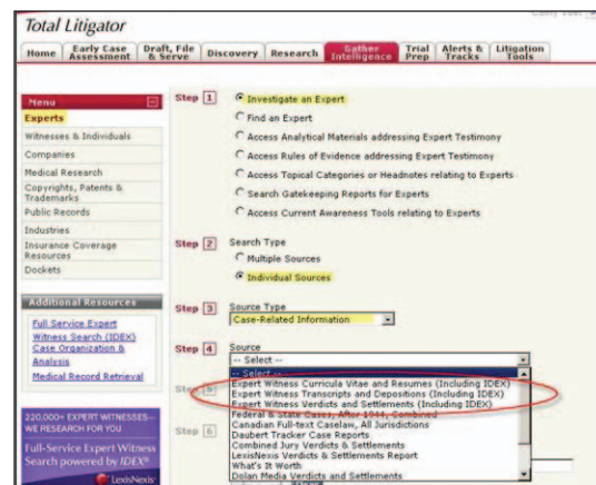
Expert Witness Verdicts & Settlements