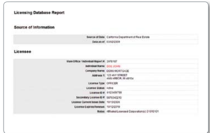
Licensing Database Report

Since 1990, the LexisNexis® Mortgage Asset Research Institute has grown to become a recognized leader and premier provider of information about mortgage professionals and companies and essential risk management solutions. The LexisNexis® Mortgage Asset Research Institute developed the Mortgage Industry Data Exchange (MIDEX®) as a powerful tool used to help subscribers defend against mortgage fraud and the perpetrators of fraudulent schemes.