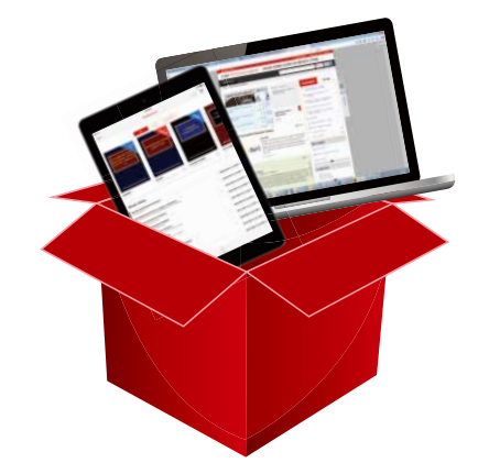
As part of a larger package of LexisNexis content

For more information visit www.lexisnexis.com.hk/lexisred contact your Account Manager or call Customer Support on +852 2179 7888