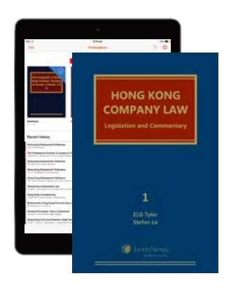
Lexis® Red + print