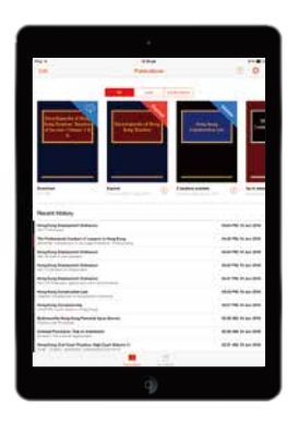
Lexis® Red stand alone