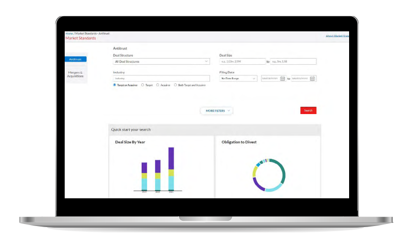
Search quickly, broadly and deeply.